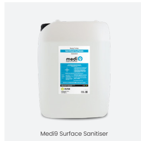
Medi9 Surface Sanitiser