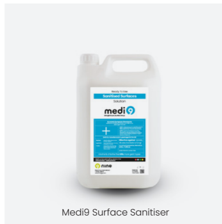
Medi9 Surface Sanitiser