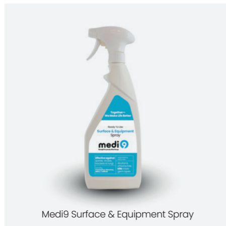
Medi9 Surface & Equipment Spray