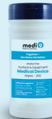
Medi9 Medical Device Wipes