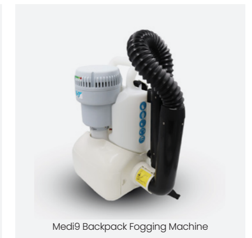
Medi9 Backpack Fogging Machine