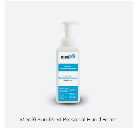
Medi9 Sanitised Personal Hand Foam