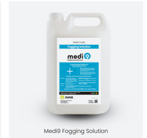
Medi9 Fogging Solution