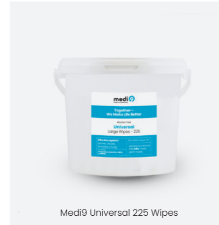
Medi9 Universal 225 Wipes

Medi9 is supplied RTU to ensure consistent quality of the product and avoid risk of human error, such as using contaminated water, over/under dosing etc.