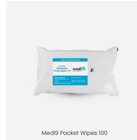
Medi9 Packet Wipes 100