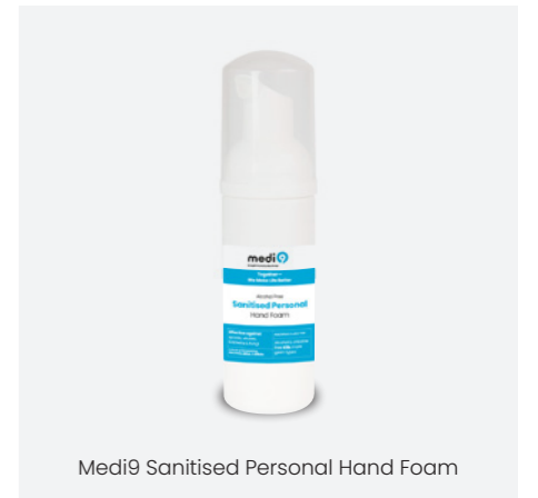
Medi9 Sanitised Personal Hand Foam