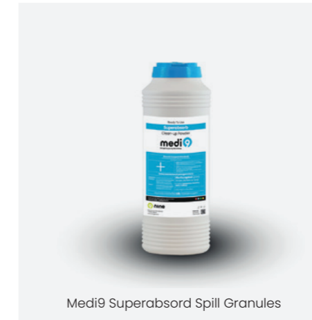
Medi9 Superabsorb Spill Granules