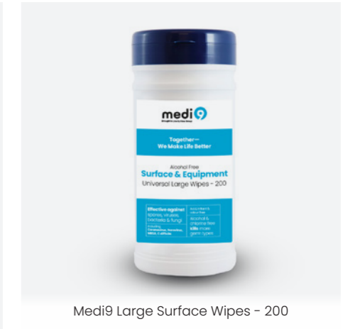
Medi9 Large Surface Wipes - 200