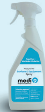
Medi9 Surface & Equipment Spray

We work with a wide range of clients across numerous NHS trusts, private hospitals, and emergency services. Due to our unique track record in infection control, we have recently expanded into hospitality, education, and commercial sectors.