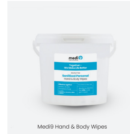
Medi9 Hand & Body Wipes