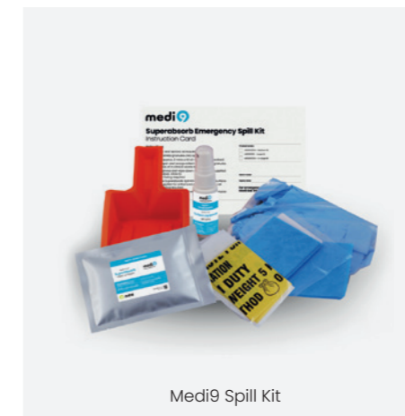
Medi9 Spill Kit