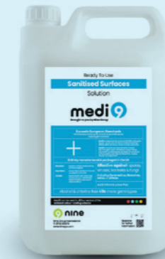
Medi9 Surface Sanitiser Solution