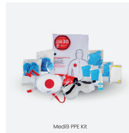
Medi9 PPE Kit