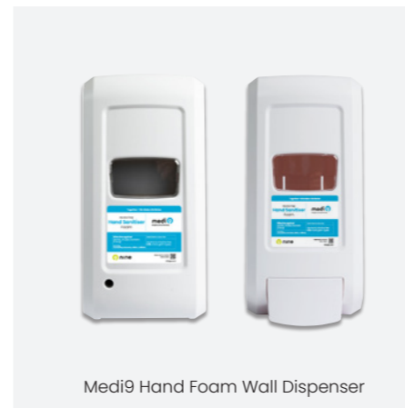
Medi9 Hand Foam Wall Dispenser